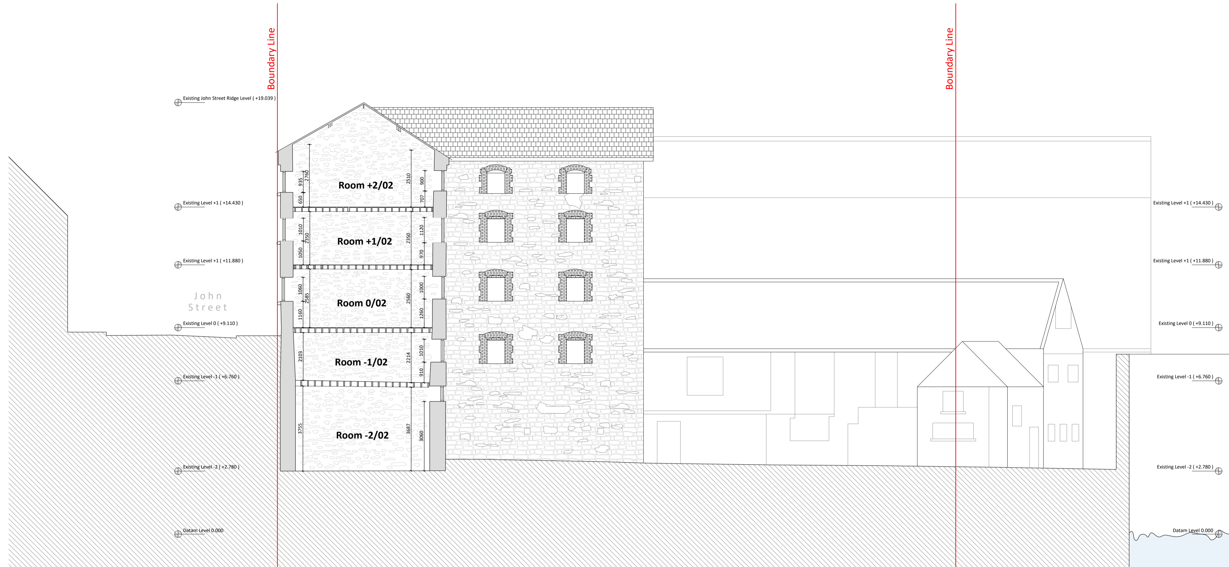
01 Section E-E Scale: 1:100